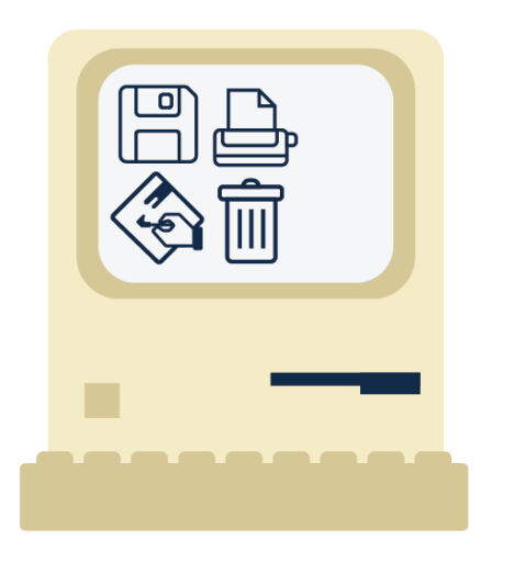
PCs with graphics