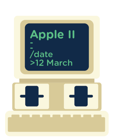
PCs that only use commands